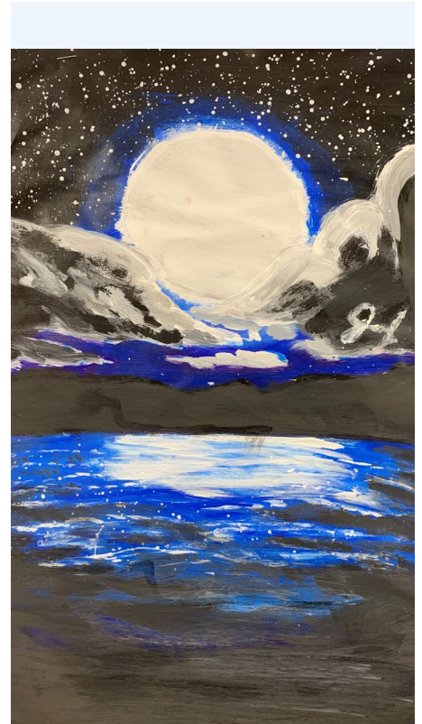
Night Sky Jamell Harris

We all do best when our days are structured and consistent. So much of that structure is lost without school and extra-curricular activities. Creating a daily schedule can help maintain consistency. It can also help you incorporate some of the coping strategies recommended in this guide. This worksheet can help.