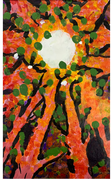
Abstract Trees Destiny Brickerson