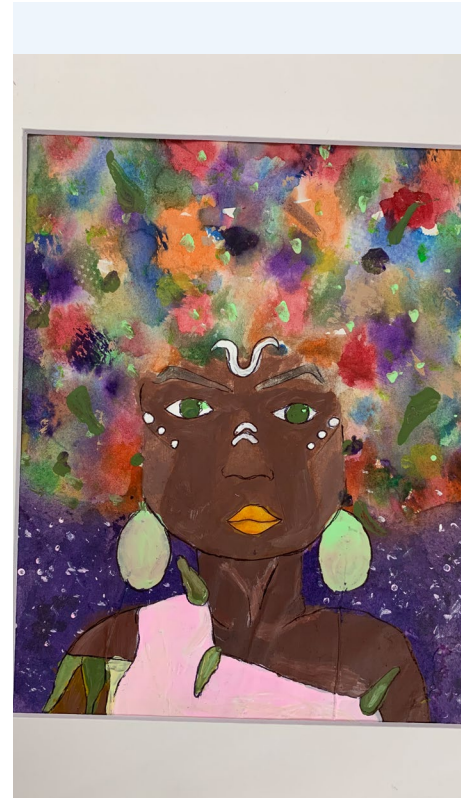
My Hair of Many Colors

See examples of common worried thoughts and more helpful thoughts, on the next page